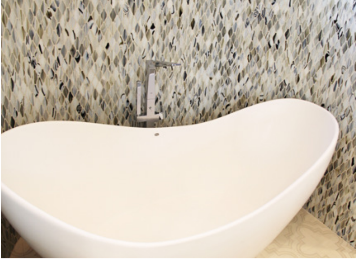
1. Master Bathroom, Contemporary Design Los Angeles, CA